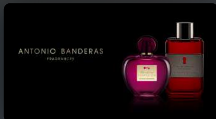
ANTONIO BANDERAS TV spot