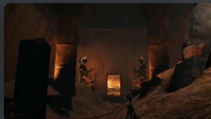
TUTANKHAMUN TOMB 3D Project