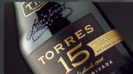
TORRES 15 TV spot